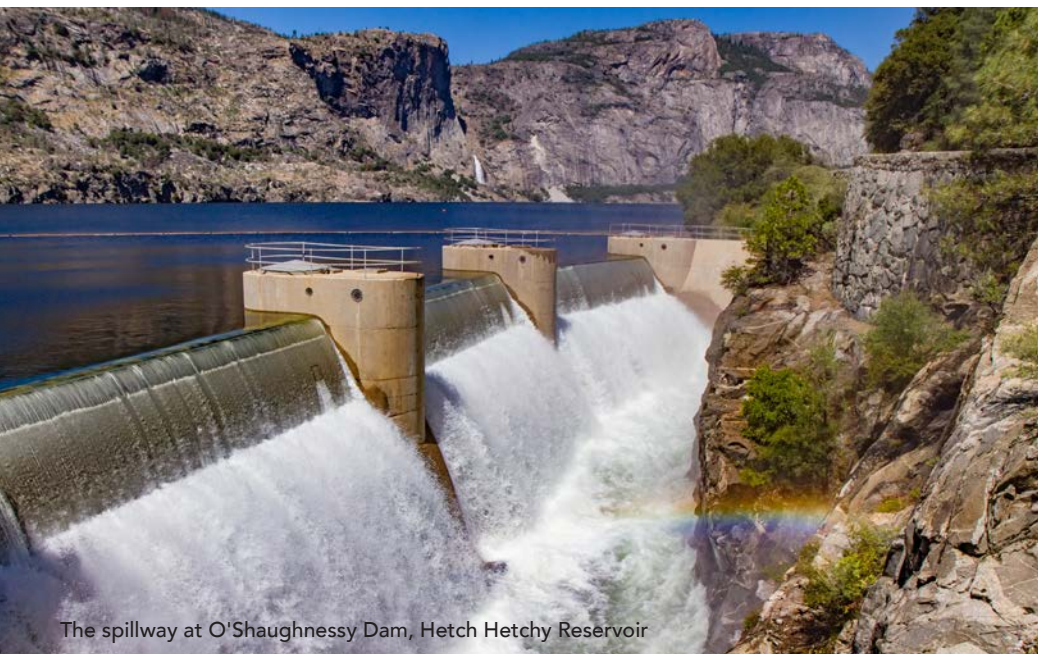
The spillway at O'Shaughnessy Dam, Hetch Hetchy Reservoir

Water Conservation Hotline ► SCVWD (408) 630-2554 valleywater.org