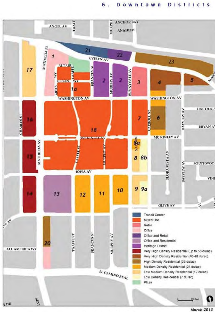
Figure 2-1: Currently Adopted DSP Land Uses and Blocks