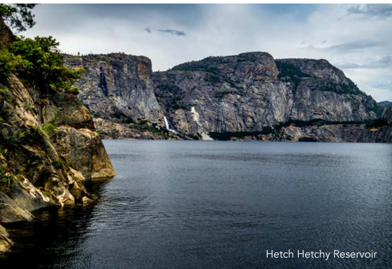
Hetch Hetchy Reservoir

Visit waterboards.ca.gov/drinking_water/certlic/drinkingwater/DWSAP.html for more information, or call (408) 730-7400 to schedule a time to view the City's DWSAP.