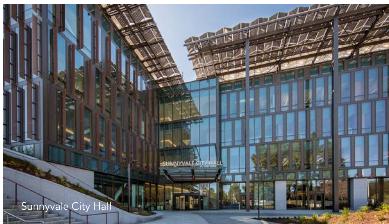
Sunnyvale City Hall

City residents play an important role in preventing cross-connections and maintaining water safety. The City wishes to raise awareness and encourage responsible water usage so that we can all contribute to the overall protection of our water resources.